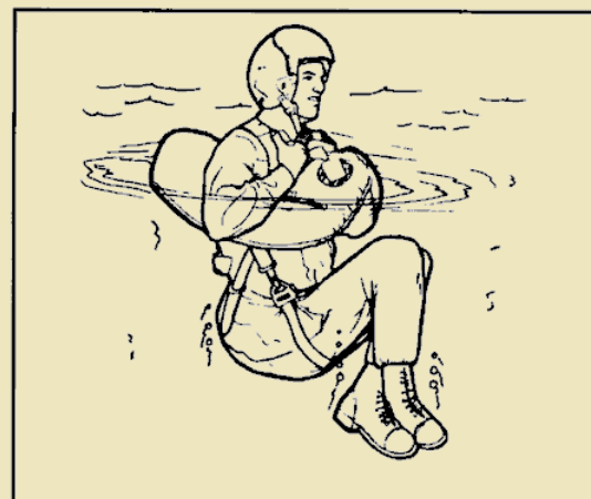
Figure 16-3. HELP position.