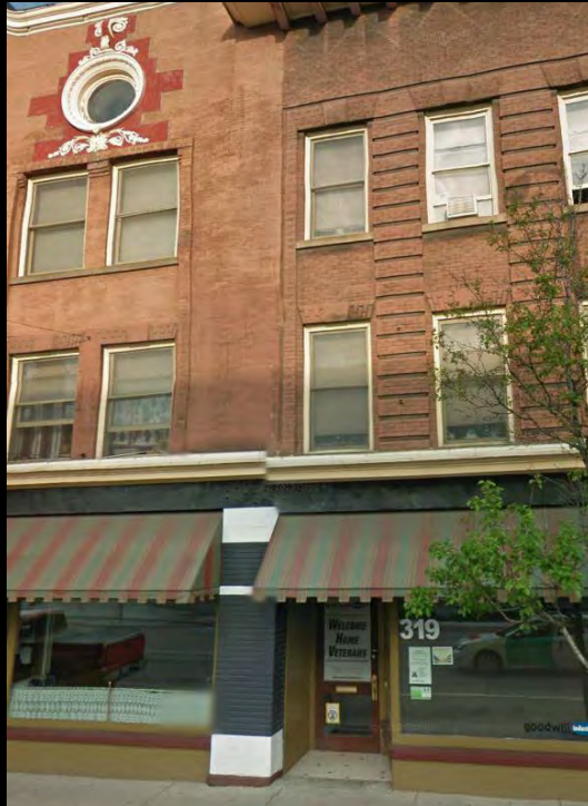
319 South Division Street, Grand Rapids